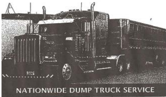
NATIONWIDE DUMP TRUCK SERVICE

Also Serving You From Kaukauna • Madison • Eau Claire